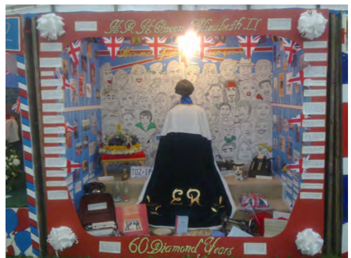
(The Queen is depicted looking out on to a montage of "cartoon" faces of the famous people and celebrities who span the 60 years)

Warleggan YFC, again for the second year running, were awarded top marks in the Cubicle Competition the subject of which was 60 years of the Queen's reign. Congratulations and well done to our hard working Club.